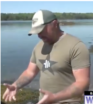
WABI , 0:17