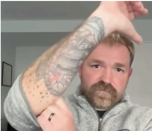
Pod Save America , Oct 20, 2025, blaming his sleeve tattoos for forcing him out of the Marines