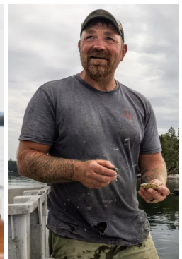
CNN , Oct. 16, 2025