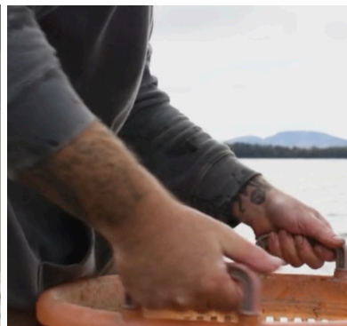
Frenchman Bay Conservancy , 4:03